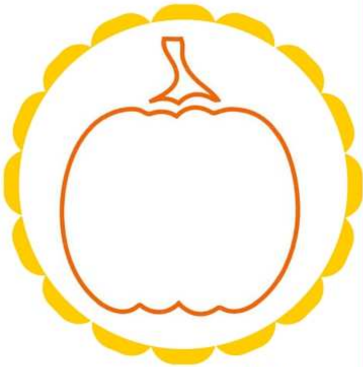
COLOR & DRAW A SILLY FACE ON THE PUMPKIN